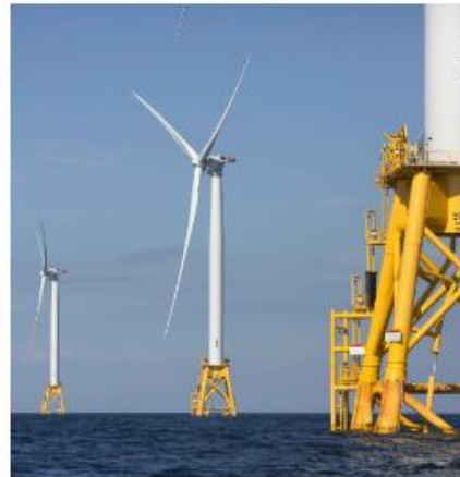
Offshore wind turbines near Block Island, R.I. A large offshore wind energy project planned off the coast of New Jersey will connect onshore to two former power plants, and cables will run under two of the state's most popular beaches.

Isn't it amusing how conservative groups, think tanks, and NIMBY organizations have suddenly developed concern for animals and the environment? Despite a simple timeline that shows how whale deaths in New Jersey couldn't be linked to offshore wind development, and despite the actual science that shows how warming waters caused by climate change would lure more whales to the coast (and thus there would be more whale mortality), these groups persist in linking whale deaths to wind. I am completely in favor of researching how wind will affect both marine and avian life: We need to know these costs so that we can mitigate them.