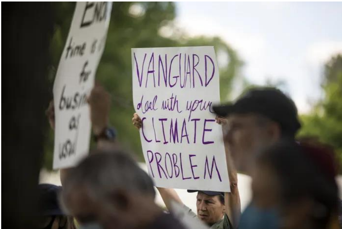
Demonstrators organized by the Sunrise Project and others gather at Cedar Hollow Park to rally and march to Vanguard's Malvern headquarters to call for Vanguard to take action on climate matters on Thursday, June 24, 2021

Read the remainder of the article here: https://www.inquirer.com/opinion/commentary/vanguard-net-zero-withdrawal-climate-change-investment-risk-20230109.html