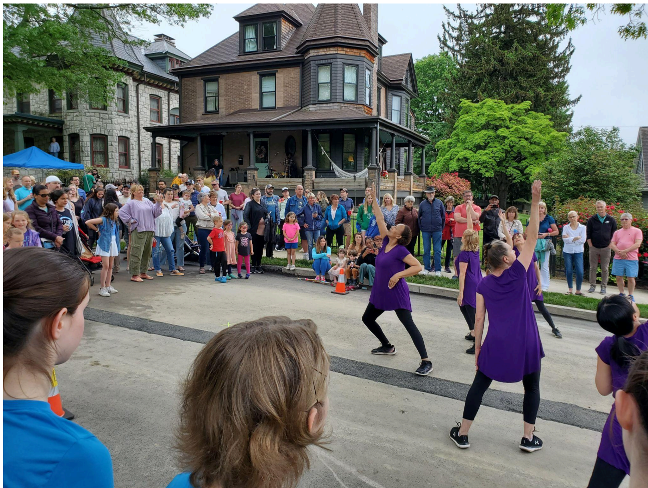
Diane Matthews School of Dance Arts dancers performing at Porchfest.

https://www.sierraclub.org/sierra/2024-1-spring/top/tree-grows-brooklyn-and-every-city